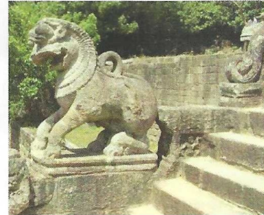
The Yapahuwa guardian stone lion is in Sri Lanka.

ceramics have been found, known to be some of the finest specimens located on the island.*