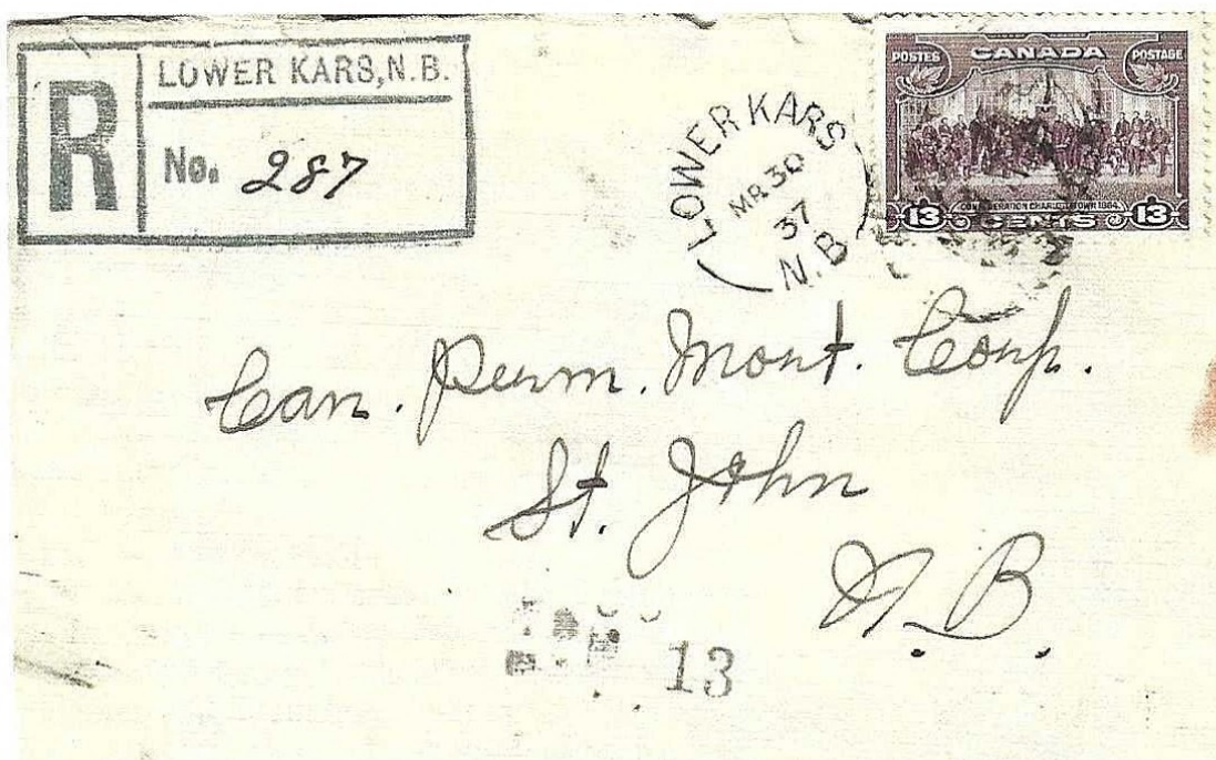
Fig. 2 - Lower Kars Postmark.