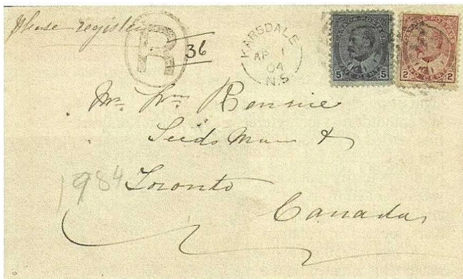
Fig. 3 - Karsdale Postmark.

The second place in Canada named Kars is in New Brunswick. It is a rural community in Kings County which is a part of the Kars Parish. Actually, there are two communities – Kars and Lower Kars in the Parish with separate post offices. Kars Parish served by two cable ferries. The Belleisle Bay Ferry connects Kars year round to Long Point and the Evandale Ferry connects Kars year round to Evandale. The community is named after the Siege of Kars, last major operation of the Crimean War. Kars was erected in 1860 from combining Greenwich and Springfield